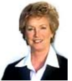
Governor M. Jodi Reil

"By addressing both national and commercial needs, the SBIR plays a valuable role in providing funding and validation for new and better products and services. The support of an SBIR can make the difference between an idea on the drawing board and a profitable product."