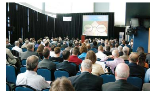
Pictures taken at our two Regional Conferences, "The Future of Manufacturing is INNOVATION™" - 2006 & 2007