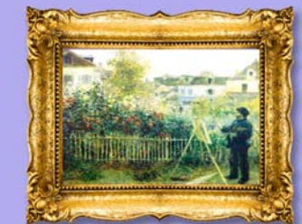
Evening Reception Nov. 12 at the Wadsworth Atheneum

* Special Forensic Exhibit at the Wadsworth - "What Lies Beneath" Old Paintings!